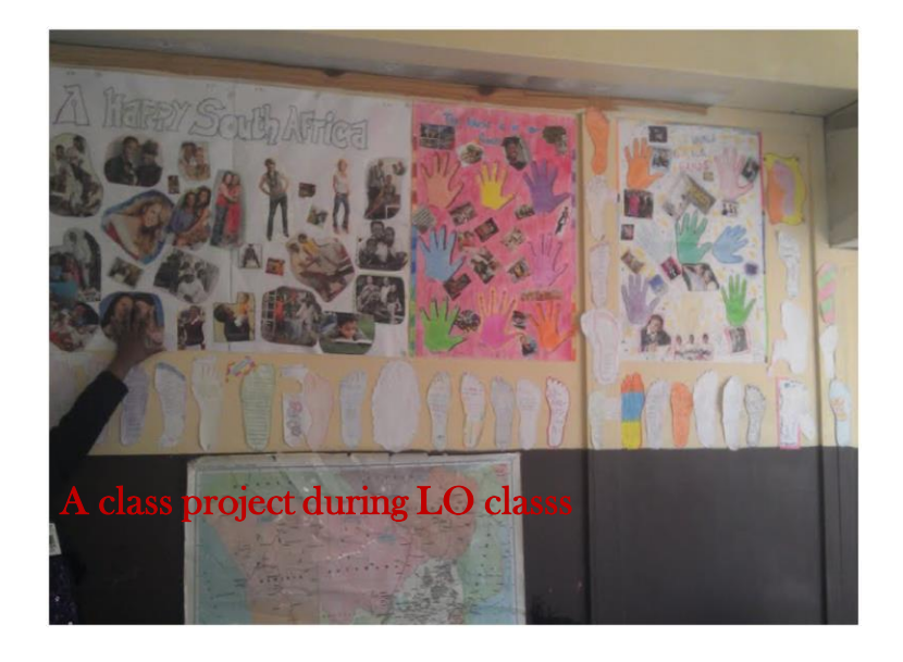
Figure 1: A happy South Africa

"people like us are not always welcomed by South African's, they think that we are here to cause trouble but all we want is to learn, our homes are troubled by wars, thanks to LO (Life Orientations) subject at schools we find acceptance" 1