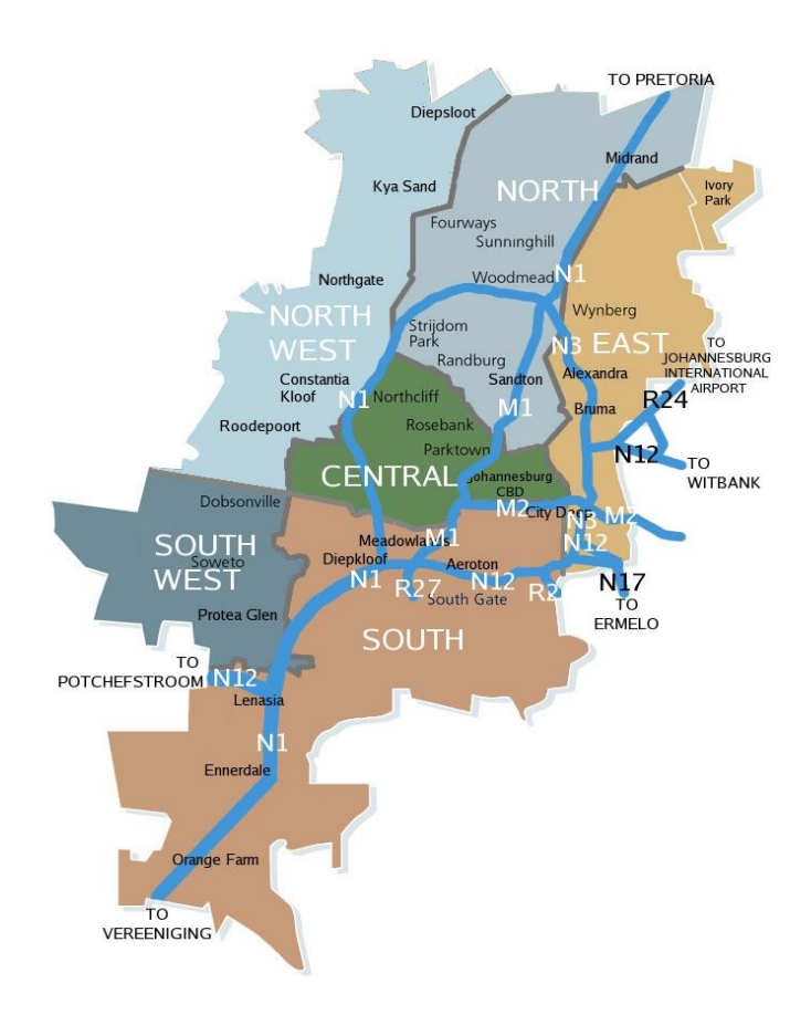
Map 2: Johannesburg map showing the neighbouring towns